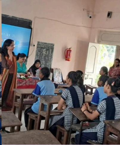
આદર્શ માધ્યમિક શાળા, મોતીવાડા